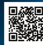
The VARIO principle

Quality-conscious, sustainable and future-oriented – SCHUCH luminaires are unmistakable brand products “Made in Germany”