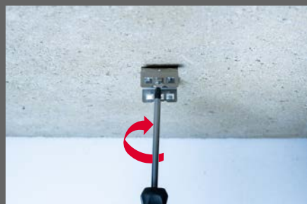
Screw on mounting clamps