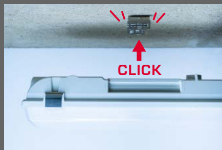
Click in the light fitting